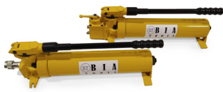
HP-80 & HP-84